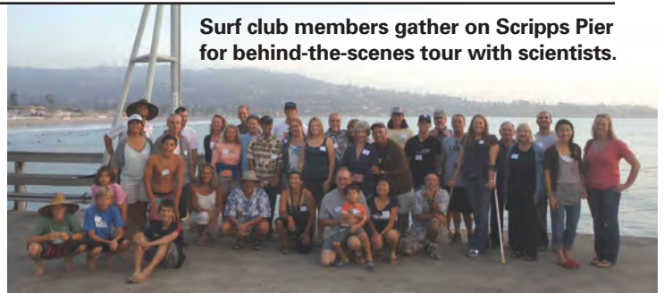
Surf club members gather on Scripps Pier for behind-the-scenes tour with scientists.

The Oceanographic Collections of Scripps Oceanography/UCSD are world-renowned resources supporting basic research, educating current and future generations of scientists, providing factual information to governmental agencies and public policy makers, stimulating curiosity and scientific understanding, and providing a